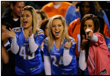
Who Do We Play For? Our Pride and Our Fans!!!