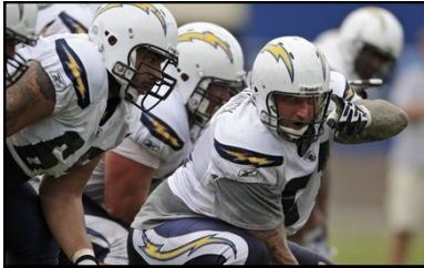
Charger Offensive Line Their best group?